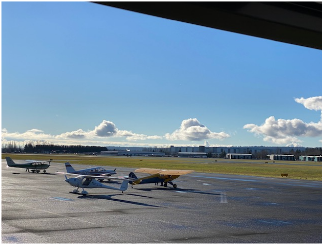
Beautiful planes and clouds