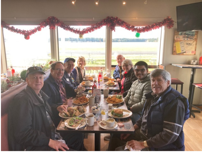
The Group at Ellie's at the airport