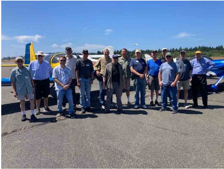
June Fly-Out Group

Some of the many airplanes that were in our Fly-Out