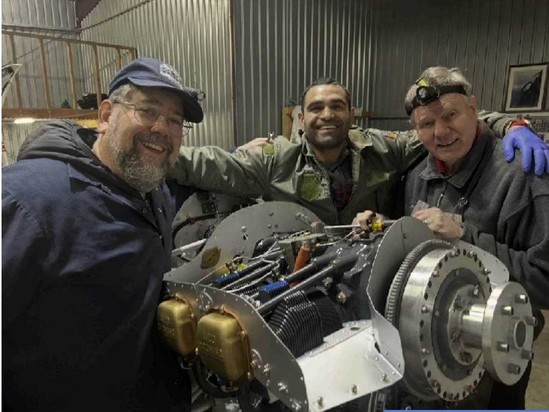
We helped one another