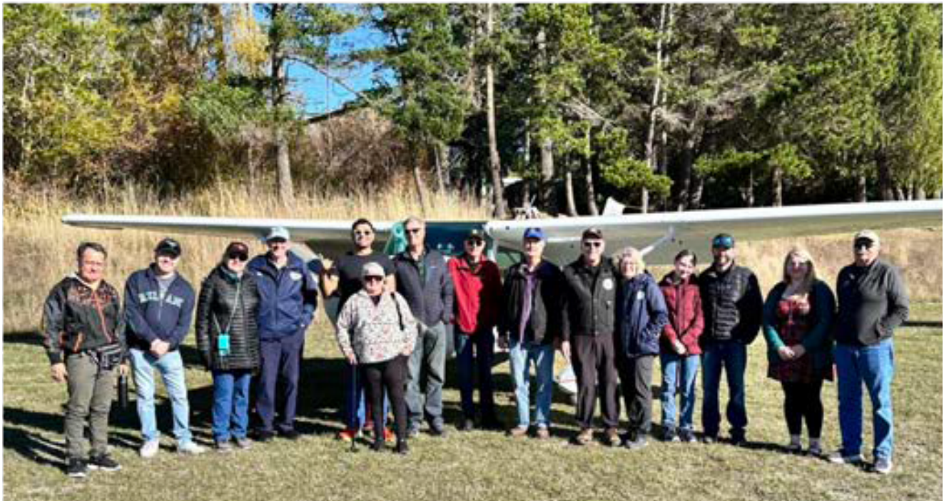
Roche Harbor Fly-out (Oct 2025)

inspiring and educational for everyone who attended. I also organized a monthly fly-out to Roche Harbor, creating another opportunity for pilots to stay active, connect, and share their passion for flying. I also had the opportunity to help coordinate the Olympic Peninsula Air Affaire, which was a rewarding experience that allowed me to contribute behind the scenes and support an event that brings