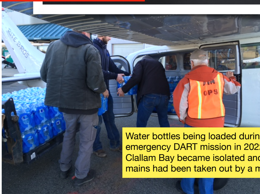
Water bottles being loaded during an actual emergency DART mission in 2022 after Clallam Bay became isolated and their water mains had been taken out by a mud slide