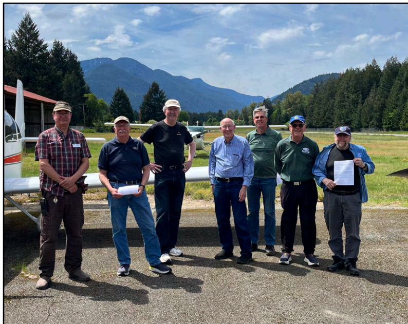
Happy fly-out attendees