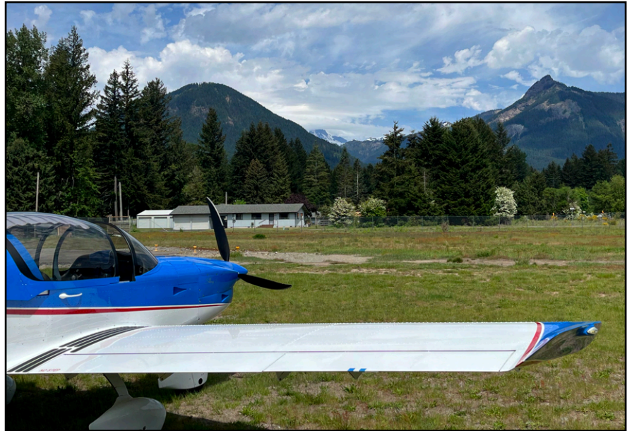
Sling 2 with Mt. Rainer peeking through