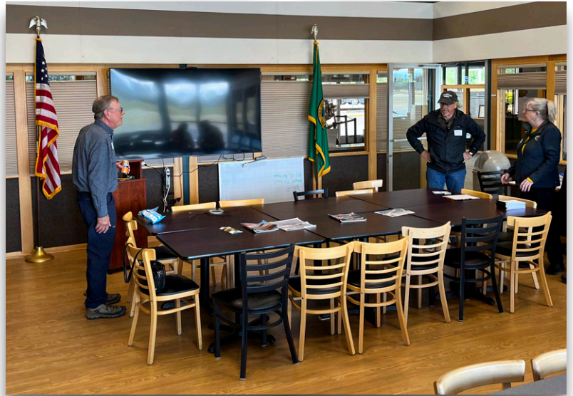
EAA 430 - Flying Start Seminar May 16 ( all about becoming a pilot )