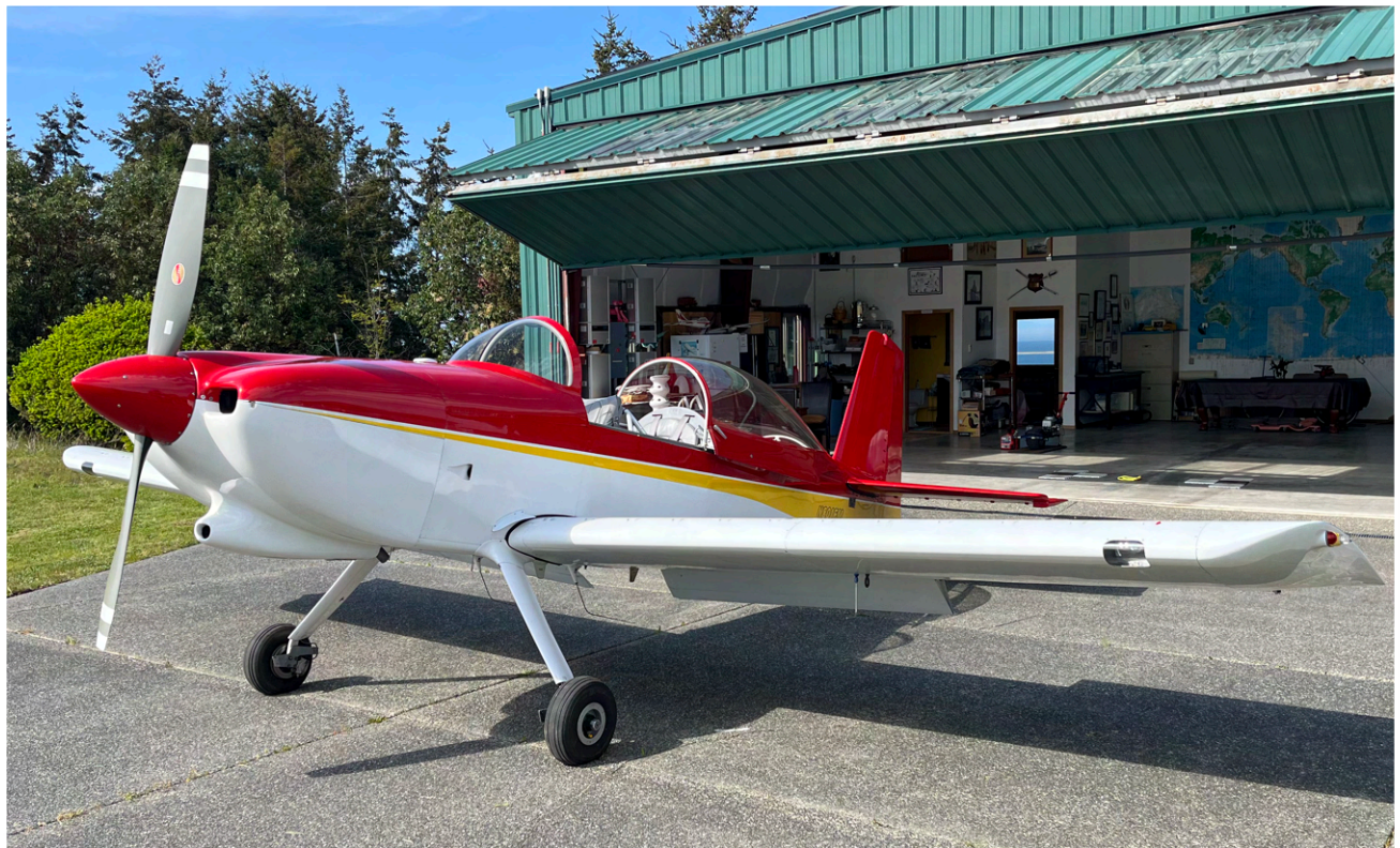
Keith's RV-8 - Honorary 4pm roll out (May 1, 2026)