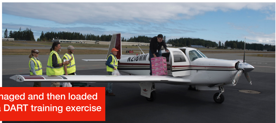
Supplies being managed and then loaded by the pilot during a DART training exercise