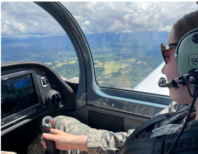
Young Eagle at the controls