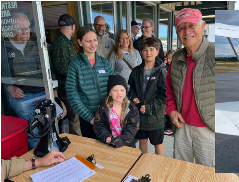
YE Pilot Dispatch