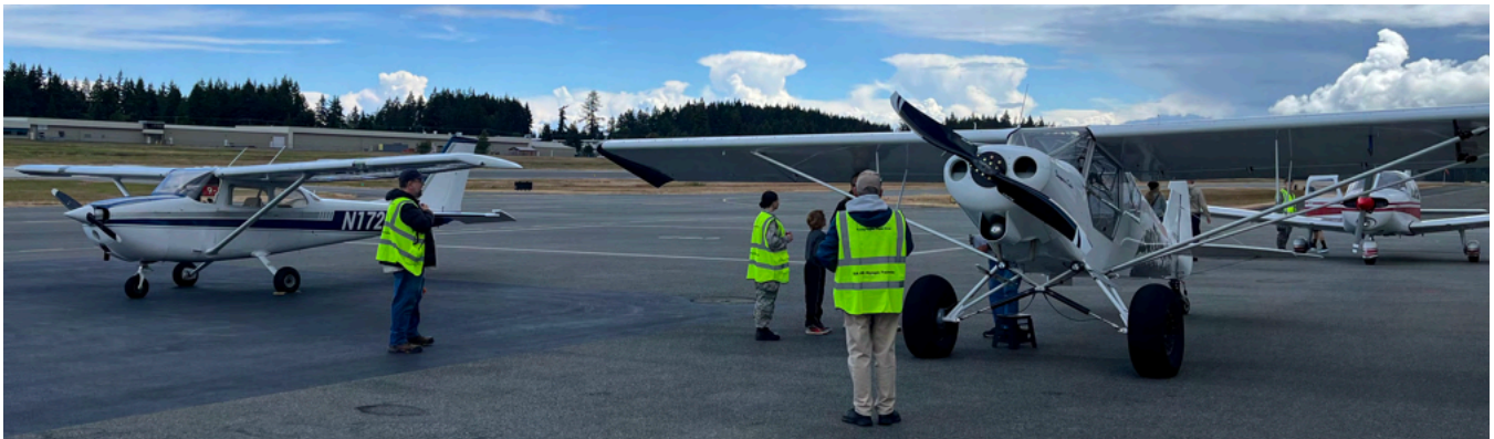
The Flight Line